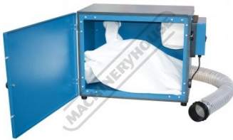
Easy Access Door