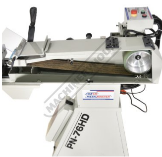
Quick change belt system