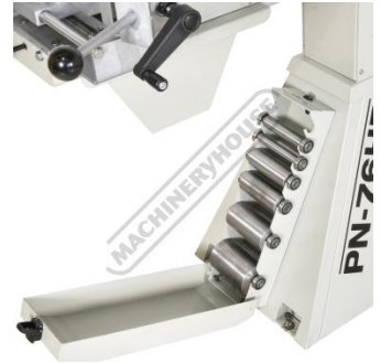
Covered storage rack for included rollers