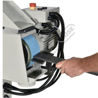
End station for linishing flat bar