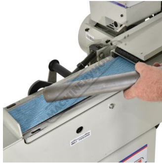
Top station for flat liishing deburring