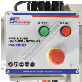
Top Control Panel