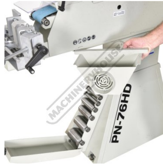
Removable dust tray