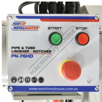
Top control panel