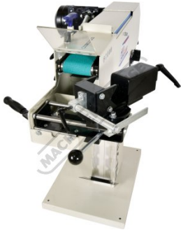
Swivel Vice From 30 90