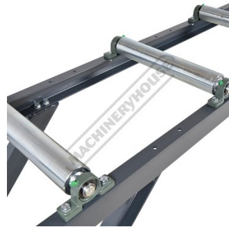
Additional Drill Holes For Extra Rollers