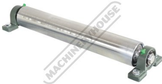
450mm Heavy Duty Ball Bearing Rollers with Grease Nipples