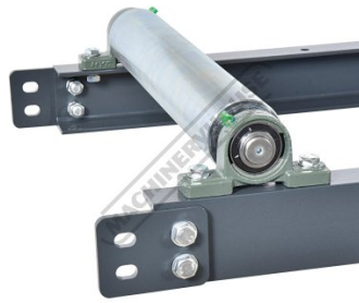
Extendable Attachment Plates