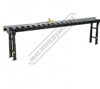
Shown With Optional Roller Conveyor