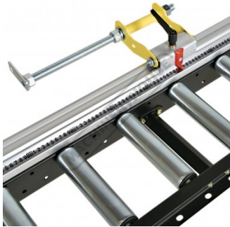
Shown In Open Position