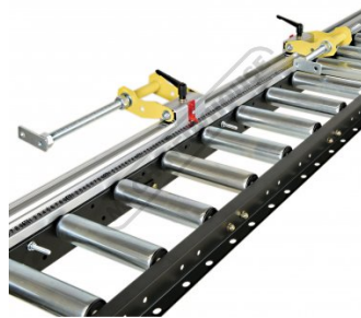
Shown With Optional Length Stop