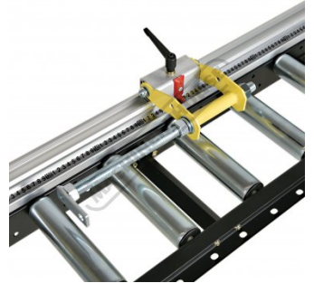
Shown In Stop Position