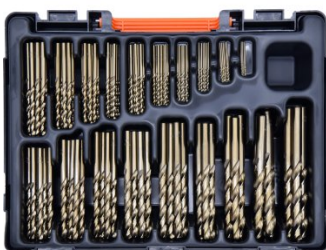
D126 Metric 135° Precision HSS Drill Set - 170 Pieces