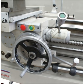
Rapid Traverse Selection Lever on Saddle