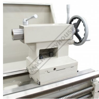
Heavy duty tailstock