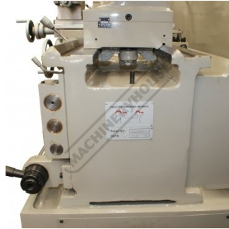
Induction Hardened Bedways