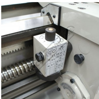
Thread Chasing Dial