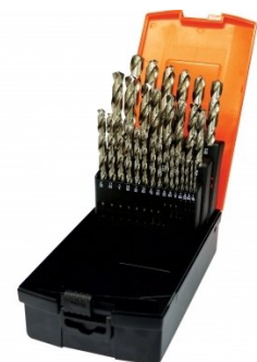
D1282 Imperial 135° Precision HSS Drill Set - 29 Piece