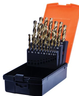
D1272 Metric 135° Precision HSS Drill Set - 25 Piece