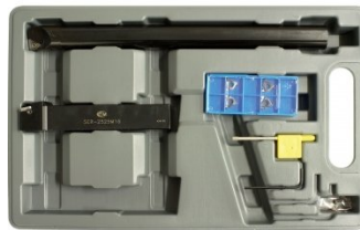
L467 Professional Lathe Parting Tool Kit - Insert Type