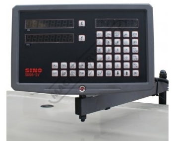
2 Axis digital readout system