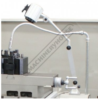
Worklight and Coolant System