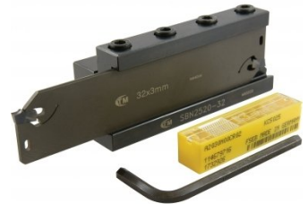
L467 Professional Lathe Parting Tool Kit - Insert Type