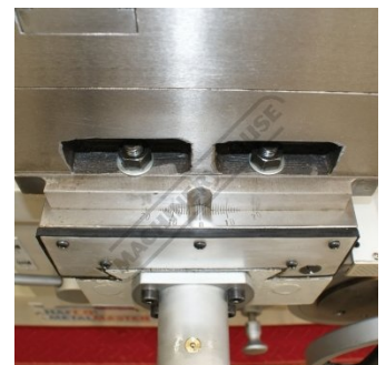
Taper Adjustment on Compound Slide