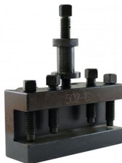
L297A Quick Change Toolpost Holder - Std