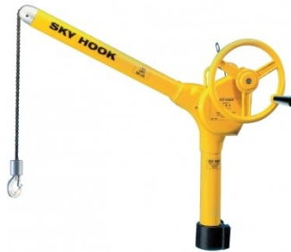
A358 Sky Hook Lifting Device