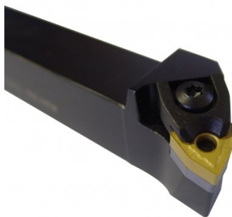
L042 Left Hand Turning Tool Holder