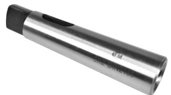
D422 Drill Sleeve - Morse Taper