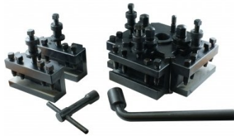
L297 Quick Change Toolpost