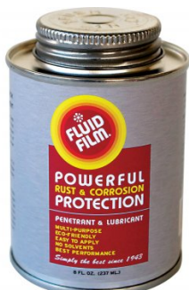
O043 Rust & Corrosion Preventive - Penetrant & Lubricant