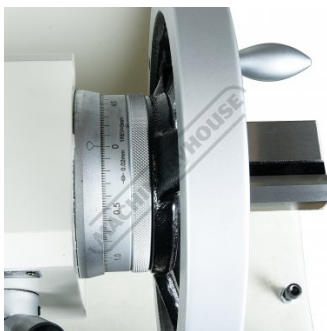
Tailstock Hand Wheel