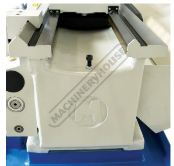
Meehanite Cast Base