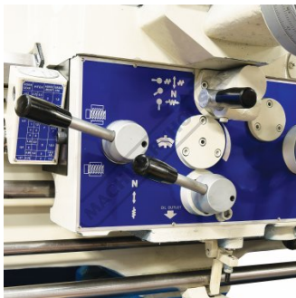
Feed & Thread Cutting Engagement Levers