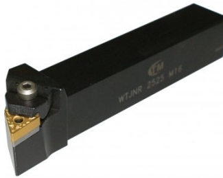
L048 Right Hand Turning Tool Holder