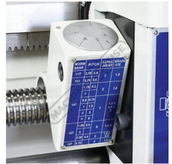
Thread Chasing Dial