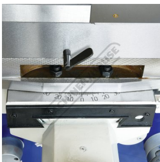
Compound Slide Angle Scale