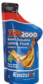
S090A Soluble Metal Cutting Fluid - 1 Litre