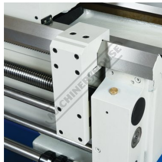
Moveable Leadscrew and Feed Shaft Support