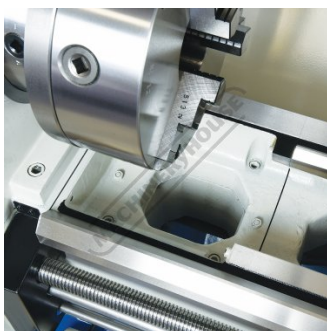
Removable Gap Bed