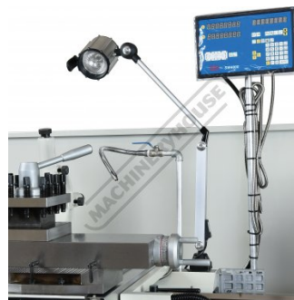
Coolant System and Work Light