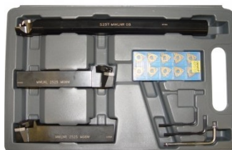
L453 Lathe Turning Tool Kit - 3 piece Insert Type