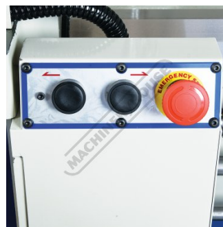
Rapid Longitudinal Buttons and Emergency Stop