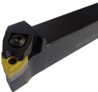
L041 Right Hand Turning Tool Holder