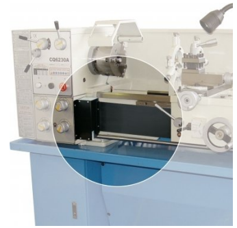
G664 Lathe Leadscrew Cover Kit