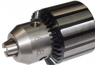
C290 Heavy Duty Drill Chuck - Keyed Type