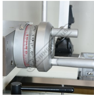
Compound Slide Hand Wheel