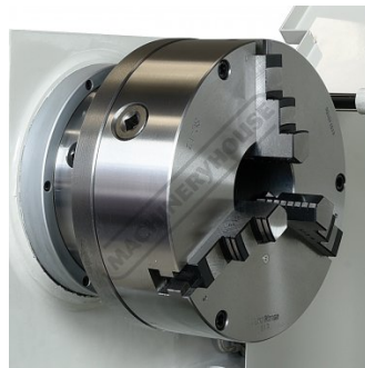
3 Jaw Chuck