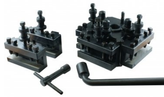
L297 Quick Change Toolpost