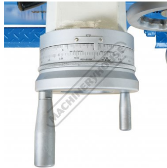
Cross Feed Hand Wheel