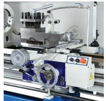
Saddle Right View