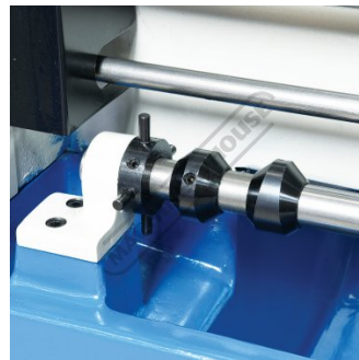
Adjustable 4 Position Length Stop