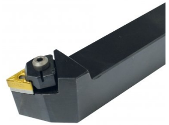
L049 Left Hand Turning Tool Holder