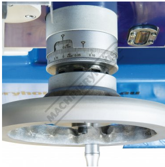
Saddle Hand Wheel