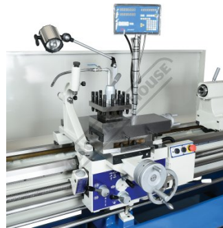
Saddle Left View