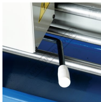
Spindle Engagement Lever