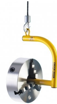
A358A Chuck Hook