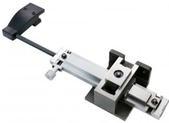
L639T Taper Turning Attachment