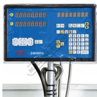
2 Axis Digital Readout System