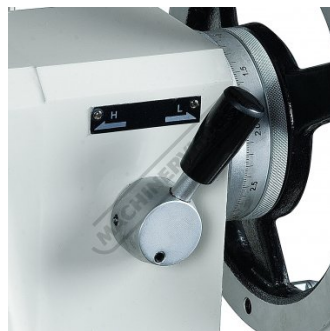
2 Speed Tailstock