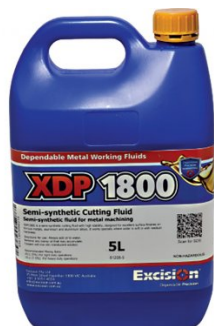
S090 Soluble Metal Cutting Fluid - 5 Litres