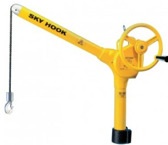
A358 Sky Hook Lifting Device