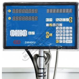
2 Axis Digital Readout System