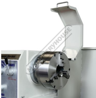
Safety Chuck Guard Open