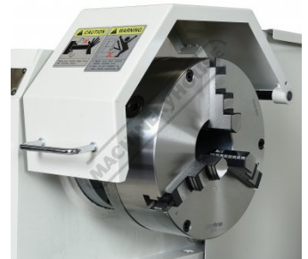
Safety Chuck Guard