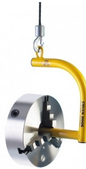
A358A Chuck Hook