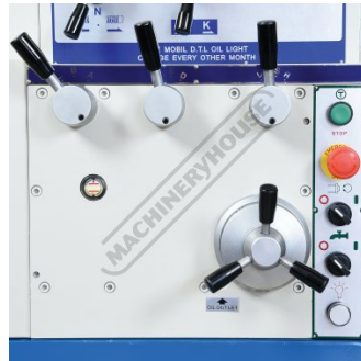
Universal Enclosed Gearbox