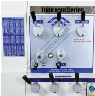
Spindle Speed Selectors