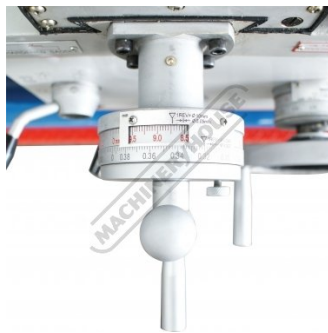
Dual calibrated dial on Handle