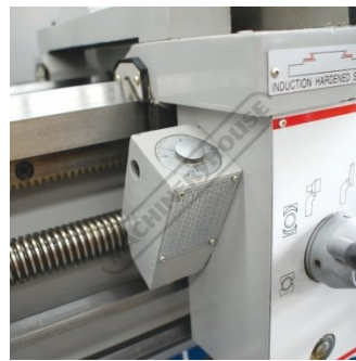
Thread Chasing Dial