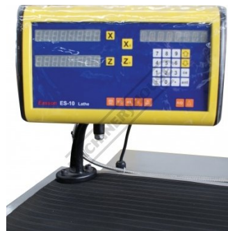
2 Axis digital readout system