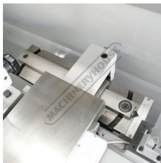
Taper Turning Attachment