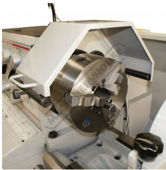
Safety Chuck Guard