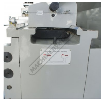
Induction Hardened bedways