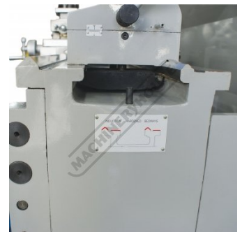
Induction Hardened bedways