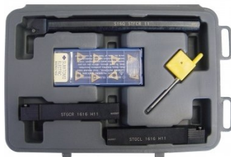
L451 Lathe Turning Tool Kit - 3 piece Insert Type