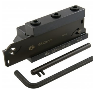
L466 Professional Lathe Parting Tool Kit - Insert Type