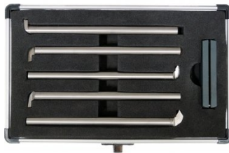
L006A Boring Bar Set - HSS