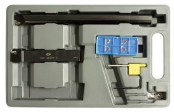
L459 Lathe Threading Tool Kit - Insert Type