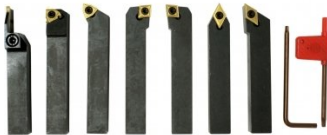
L0077 Lathe Turning Tool Kit - 7 piece Insert Type