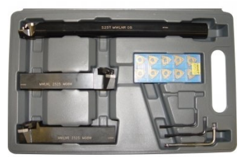
L453 Lathe Turning Tool Kit - 3 piece Insert Type