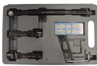
L452 Lathe Turning Tool Kit - 3 piece Insert Type