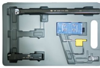
L459 Lathe Threading Tool Kit - Insert Type