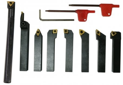
L0099 Lathe Turning Tool Kit - 7 piece Insert Type