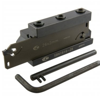
L465 Professional Lathe Parting Tool Kit - Insert Type