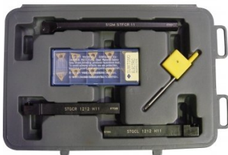
L450 Lathe Turning Tool Kit - 3 piece Insert Type