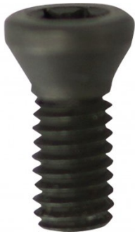
L539A Screw to Suit Threading Tool Holders