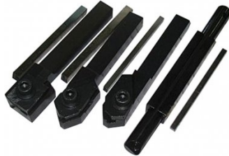
L0085 Carbide Turning Tool Set - 11 piece