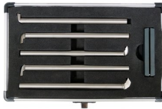
L006A Boring Bar Set - HSS