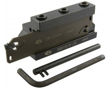
L465 Professional Lathe Parting Tool Kit - Insert Type