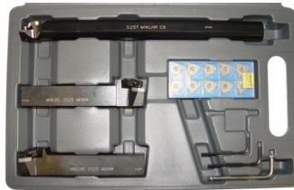
L072 HSS Turning Tool Set - 4 piece