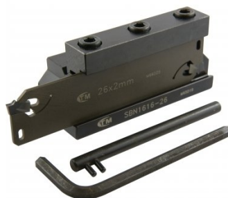
L466 Professional Lathe Parting Tool Kit - Insert Type