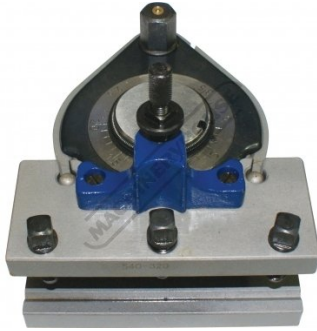
Quick Change Toolpost