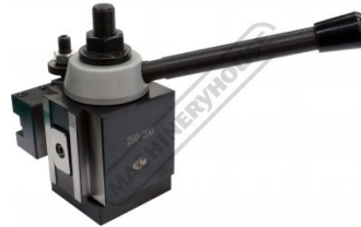
Toolpost With Holder