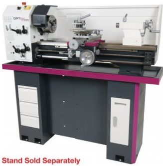
L691 Opti-Turn Bench Lathe