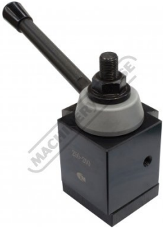
Toolpost Rear View