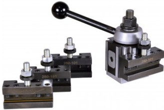
L291 Quick Change Toolpost