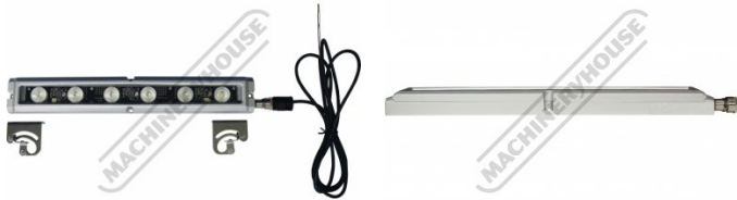
Shown with Mounting Brackets