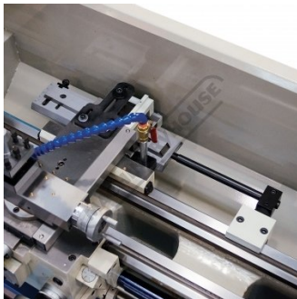
Shown Mounted to a Lathe