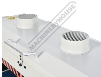
Twin 100mm Dust Ports