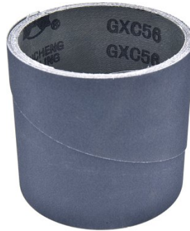
A95424 Drum Sander - Belt