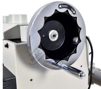
Height Adjustment Handle