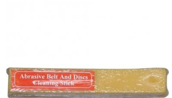
G183 Abrasive Belt & Disc Cleaning Stick