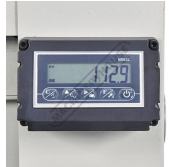
Electronic Height Reader