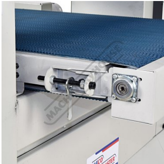
Belt Tension Adjustment