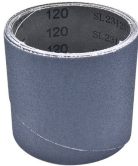
A95412 Drum Sander - Belt