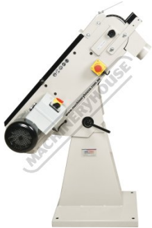
Head Tilting Up