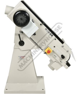
Head Tilting Down