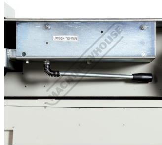
Belt Tension Lever