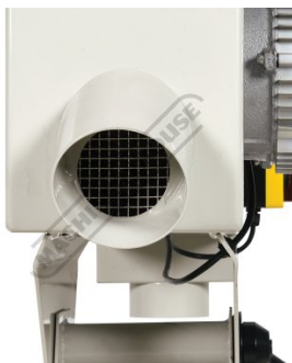
Rear Dust Chute