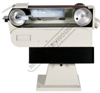
Easy To Use Belt Change System