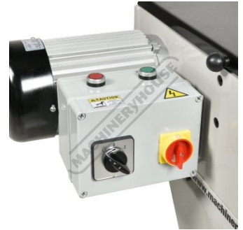
2 Speed Motor And On Off Switch