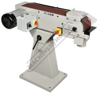
Large 150 x 465mm Working Surface