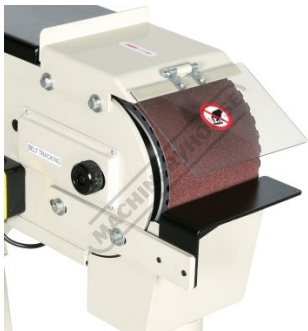
Safety Eye Shield Job Rest