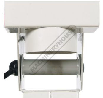
Front 100mm Dust Chute