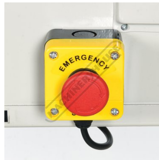
Emergency Stop Button