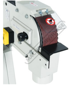
Safety Eye Shield Job Rest