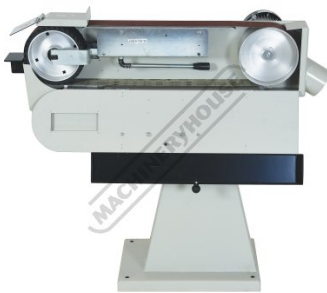
Side Open for Belt Replacement