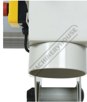
100mm Front Dust Chute