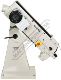
Head Tilting Down