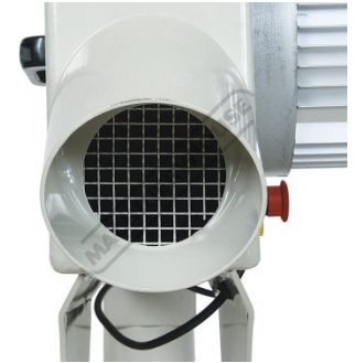
100mm Rear Dust Chute