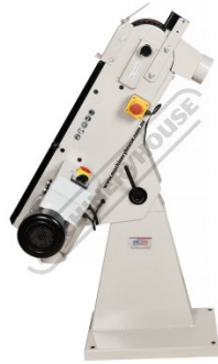
Head Tilting Up