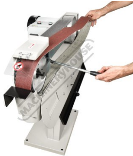
Quick Release Belt Replacement