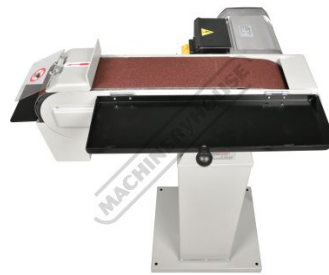
Side View With Lide Open