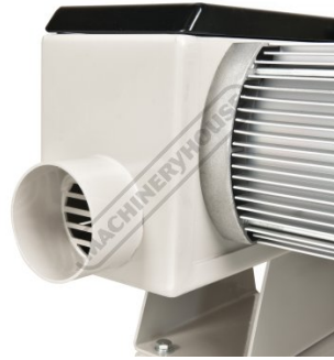
Rear Dust Chute