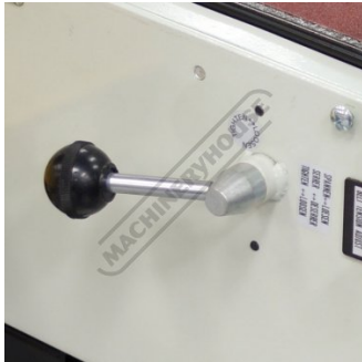
Belt Tension Lever