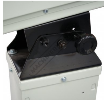
Head Tilt Adjustment