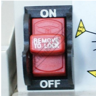
Safety Interlock Switch