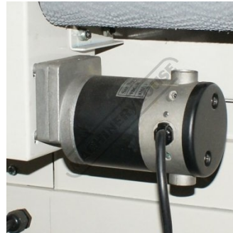
Table Feed Motor