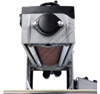
Sanding Wheel with Rollers