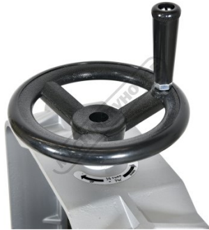
Handle For Height Adjustment