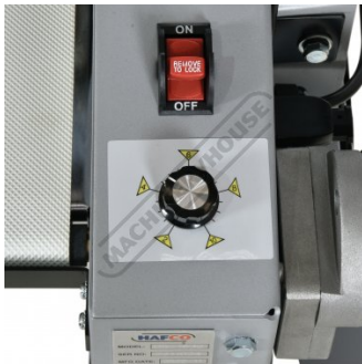
Variable Speed Dial