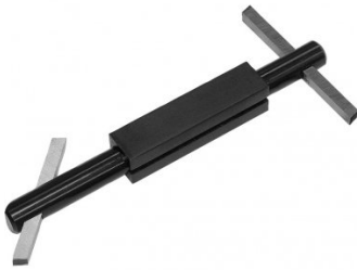
L102 Boring Bar with Holder