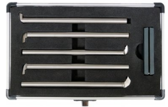
L006A Boring Bar Set - HSS