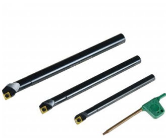
L431 Boring Bar Set - Carbide Insert