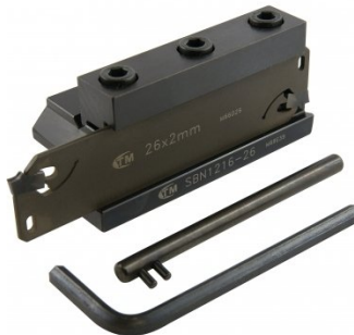
L465 Professional Lathe Parting Tool Kit - Insert Type