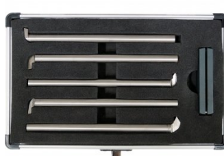
L006A Boring Bar Set - HSS