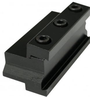
L029B Parting Block - Suits 32mm Blade