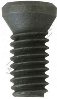
L525 Screw to Suit Turning Tool Holder