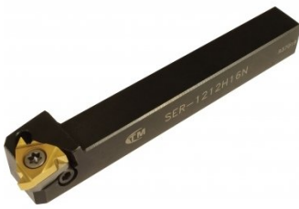
L031 External Threading