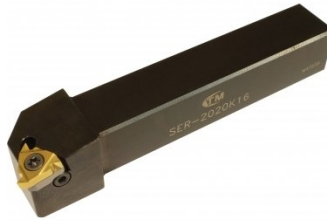
L033 External Threading