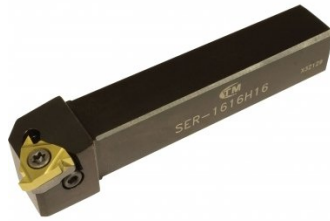
L032 External Threading