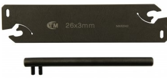
L469 Parting Blade