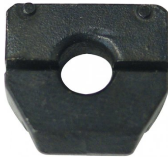
L529 Clamp to Suit Turning Tool Holders