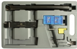
L072 HSS Turning Tool Set - 4 piece