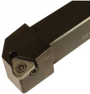
Toolholder Close Up