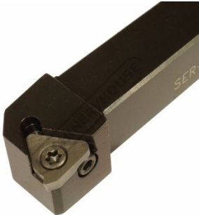
Toolholder Close Up