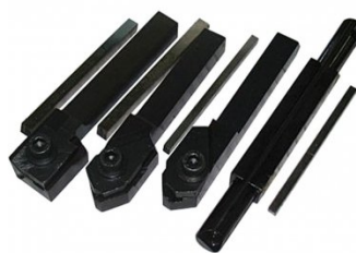
L072 HSS Turning Tool Set - 4 piece