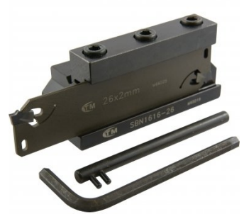
L465 Professional Lathe Parting Tool Kit - Insert Type