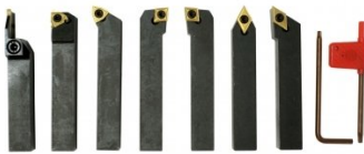
L450 Lathe Turning Tool Kit - 3 piece Insert Type