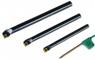
L430 Boring Bar Set - Carbide Insert