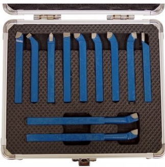
L0085 Carbide Turning Tool Set - 11 piece