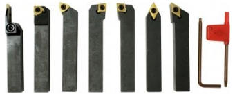
L0077 Lathe Turning Tool Kit - 7 piece Insert Type