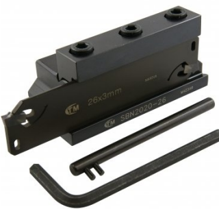
L466 Professional Lathe Parting Tool Kit - Insert Type