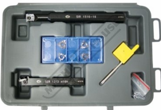
L456 Lathe Threading Tool Kit - Insert Type