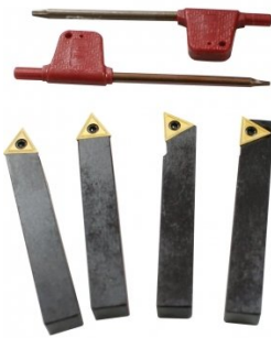
L0055 Lathe Turning Tool Kit - 5 piece Insert Type