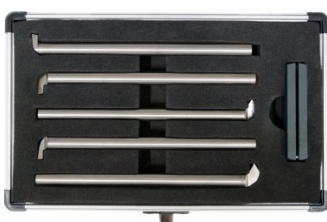
L006A Boring Bar Set - HSS