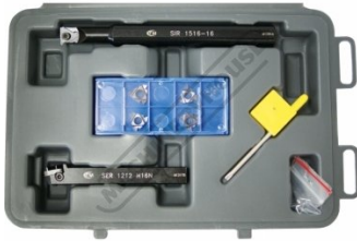
L456 Lathe Threading Tool Kit - Insert Type