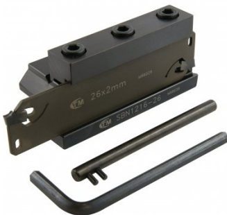
L464 Professional Lathe Parting Tool Kit - Insert Type