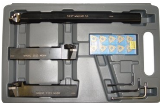
L453 Lathe Turning Tool Kit - 3 piece Insert Type