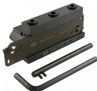
L464 Professional Lathe Parting Tool Kit - Insert Type