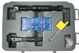
L456 Lathe Threading Tool Kit - Insert Type