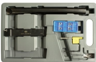
L459 Lathe Threading Tool Kit - Insert Type