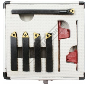
Set in Case