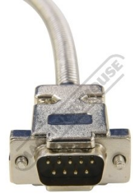
DSub9 Male Plug