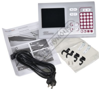
DRO Included Parts