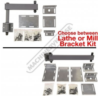
Lathe or Mill Mounting Bracket Kit