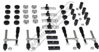
40 Piece Clamp Kit