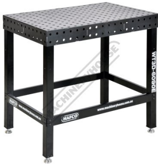
600 x 900 x 100mm 3D Welding Table