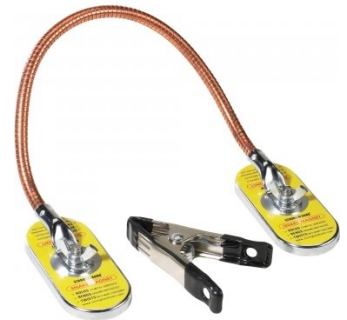
W1005 Snake Magnet & Spring Clamp Set