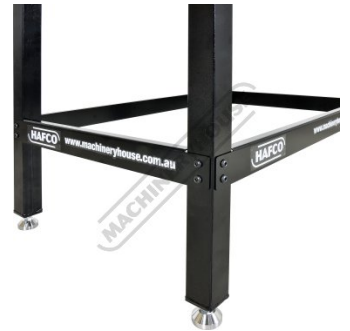
Steel Leg Bracing with Adjustable Feet