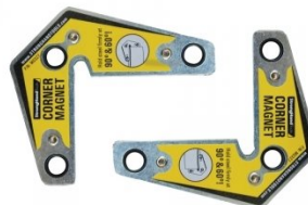
W1010 Corner Magnets - (2-Pack)