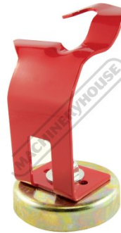
Magnetic MIG Torch Holder