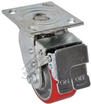
2 x Swivel Wheel With Brake