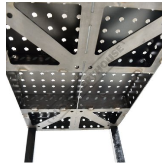
Rib Design for Strength