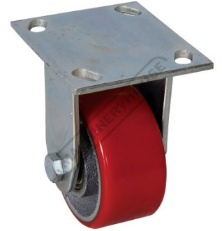
2 x Fixed Wheel