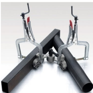
W1012 Adjustable Corner Clamping Plier Set