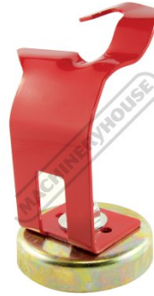
Magnetic MIG Torch Holder