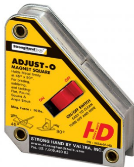
W1007 Adjust-O Magnet Square - Heavy Duty