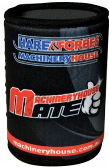
Magnetic Stubby Holder