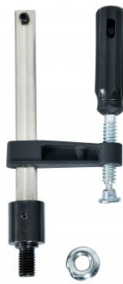
W08509 Weld Clamps with Locking Nuts (2 Piece Pack)