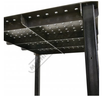
Rib Design for Strength