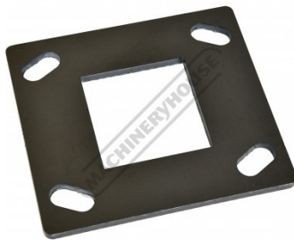
Includes 4 x Base Plates for Optional Castor Wheels