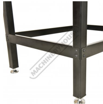
Steel Leg Bracing