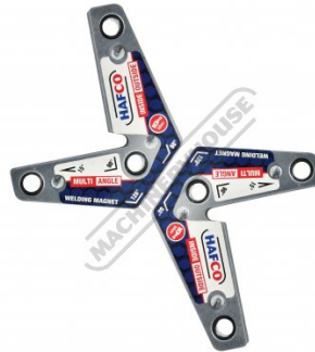
15, 60, 90 & 120 Degree Magnets