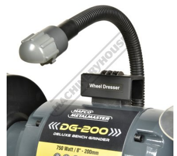
Wheel Dresser Work Light