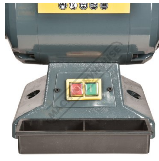
On Off Switch Cooling Tray