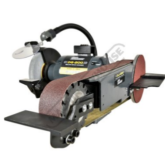
Included Adjustable Tool Rest