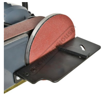
Adjustable Mitre Table