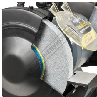
Fine Aluminium Oxide Grinding Wheel