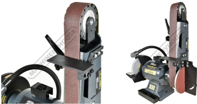
Vertical Position With Tool Rest Mitre Table Vertical Position With Tool Rest Mitre Table