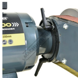
Quick Release Angle Adjustment