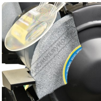
Coarse Aluminium Oxide Grinding Wheel