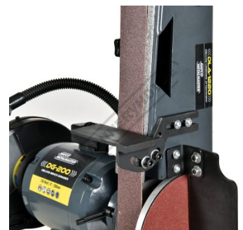
Vertical Position With Tool Rest