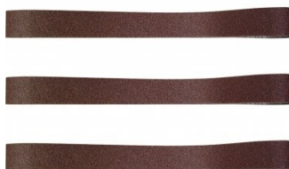
A8034 120G Aluminium Oxide Linishing Belt Pack