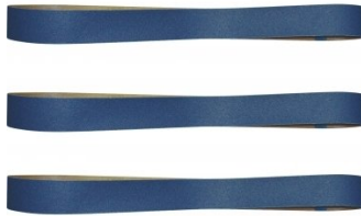
A8038 60G Zirconia Linishing Belt Pack