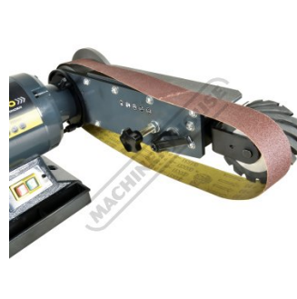
Quick Release Belt