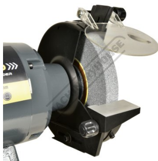
Adjustable Eye Shield Tool Rest