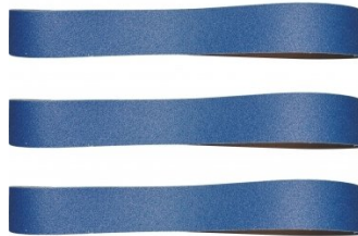
A8012 100G Zirconia Linishing Belt Pack