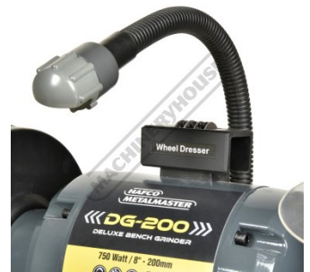
Wheel Dresser Work Light