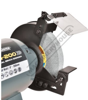
Adjustable Eye Shield Tool Rest