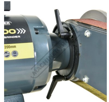
Quick Release Angle Adjustment