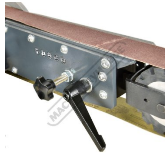
Belt Tensioner Adjustment