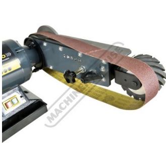
Quick Release Belt