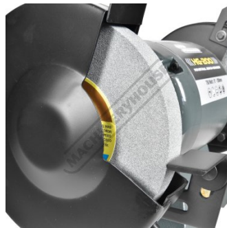
Fine Aluminium Oxide Grinding Wheel