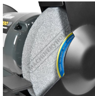
Coarse Aluminium Oxide Grinding Wheel